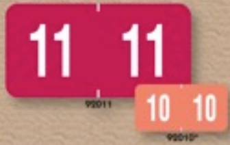
Tab Products® compatible series 3/4"H x 1-1/2"W • 500 / Roll