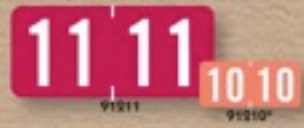
Tab Products® compatible series 1/2"H x 1-1/8"W • 500 / Roll - Kimdura