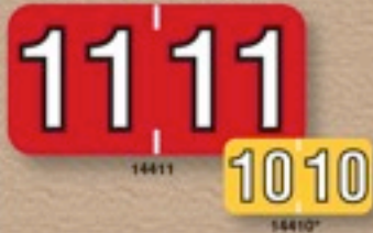
Colwell® compatible series 3/4"H x 1-1/2"W • 500 / Roll