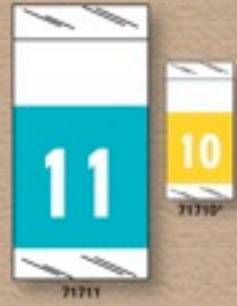
ColRTab® original series 1-1/2"H x 3/4"W • 1,000 / Roll