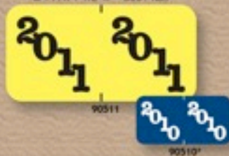
Jeter® compatible series 3/4"H x 1-1/2"W • 500 / Roll