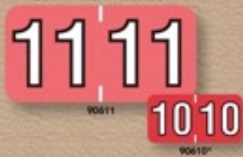
Barkley® compatible series 3/4"H x 1-1/2"W • 500 / Roll