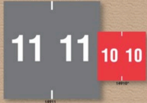
Ames® compatible series 1-7/8"H x 1-7/8"W • 500 / Roll