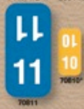
Smead® compatible series 1"H x 1/2"W • 500 / Roll