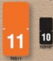
Tabbies® original series 1"H x 1/2"W • 250 / Pkg