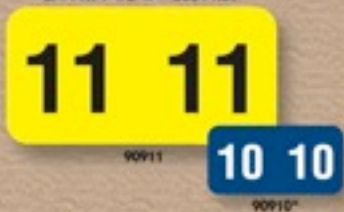
Smead®/Jeter® compatible series 3/4"H x 1-1/2"W • 500 / Roll