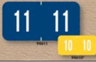
GBS®/VRE® compatible series 3/4"H x 1-1/2"W • 500 / Roll