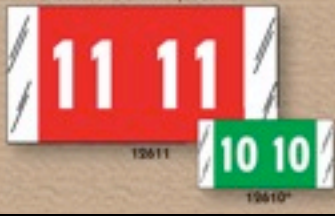
Acme Visible® compatible series 3/4"H x 1-1/2"W • 1,000 / Roll