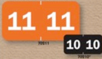
Tabbies® original series 3/4"H x 1-1/2"W • 500 / Roll